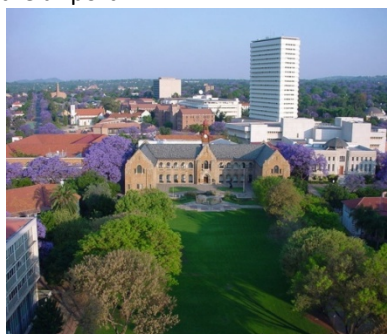
University of Pretoria, Hatfield, Pretoria